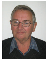
Bill Maher Rural Outreach Program