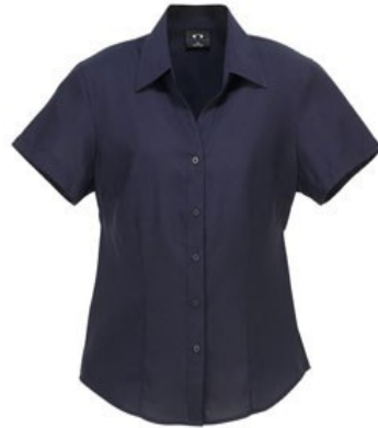
Biz Collection Ladies Plain Oasis Shirt LB3601 Navy Block colour short sleeve