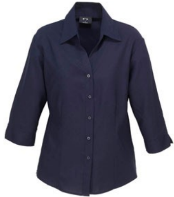
Biz Collection Ladies Plain Oasis Shirt LB3600 Navy Block colour 3/4 length sleeve