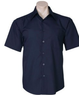
Biz collection SH715 Navy Mens short sleeve Metro Shirt

The SHDH logo only will be displayed on Environmental Services Staff Uniform.