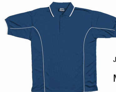
JB's Wear Mens: 7PIPWN - Navy/White