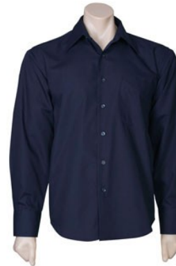
Biz collection SH714 Navy Mens long sleeve Metro Shirt