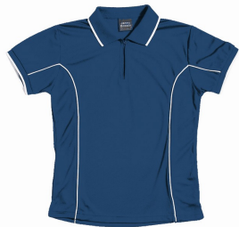
JB's Wear Ladies: 7LPINW - Navy/White

All shirts are to be worn with Navy Pants, Shorts or Skirts.