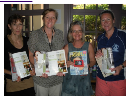
The winning walkers

Congratulations to all participants for taking part and remember to keep incorporating physical activity into your everyday routine!