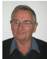
Bill Maher Rural Outreach Program